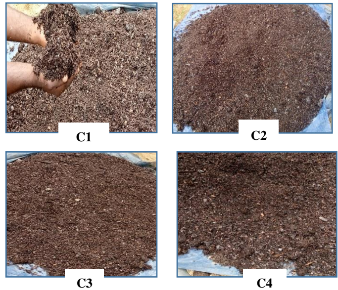
Figure 3: Composts produced from the different weights of cassava peels.

The composting of the above different treatments lasted 3 months. The produced composts (C1, C2, C3, and C4) were odourless during the composting process and presented the same odour (they did not have a smell of ammonia) at the end of composting. They had a dark brown color, relatively dry and uniform structure and its texture was similar to the soil's texture. Their temperature was 25 °C. Figure 3 below presents the obtained composts.