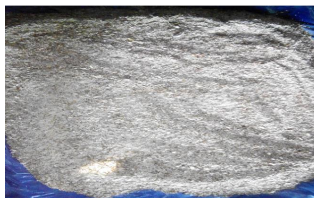
Figure 2: Cassava peels after shredded.