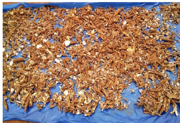
Figure 1: Dried Cassava peels.

Fresh cassava peels were collected from various sources within the subregion of Yaounde (Cameroon). The obtained cassava was air-dried for one week. Then the dried cassava peels were mechanically ground in a local mill to particles ranging 0.1 – 1.5mm. Figure 1 and 2 respectively below present cassava peels before and after shredding.