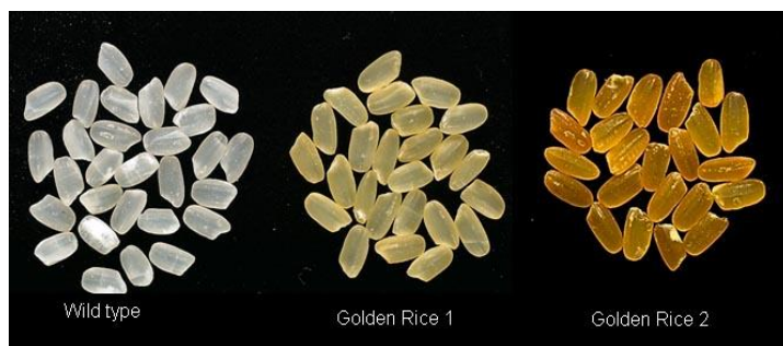
Figure 2: Grains of original golden rice (SGR1) and golden rice 2 (GR2) compared to wild type rice. GR2 contains beta-carotene levels that will provide adequate quantities of provitamin A as part of children's diet in southeast Asia [10].

The original golden rice was called SGR1. In 2005, a new variety called golden rice 2 (GR2) was created with more intense yellow rice grains due to considerably greater amounts of beta-carotene than in SGR1, shown in figure 2 [10]. The golden rice benefitted children and pregnant women suffering from vitamin A deficiency.